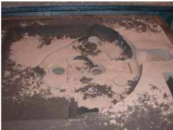
Figure 5 View at inner wheel arch cope mould

In order to create optimum conditions for mould filling, Magma simulation studies were carried out prior to casting. Figure 6 shows a simulation of the temperature distribution of the outer wheel arch directly after mould filling. Figure 7 shows a 3D version of the inner wheel arch.