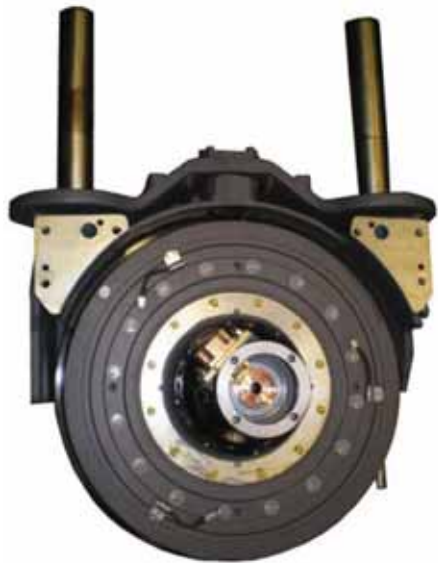
Figure 10 Sub assembled wheel arch

With the help of KALMINEX* sleeves and STELEX* PrO filters, FOSECO ensures that FWH is able to deliver highest quality castings to Siemens SGP Verkehrstechnik (figures 11 and 12).