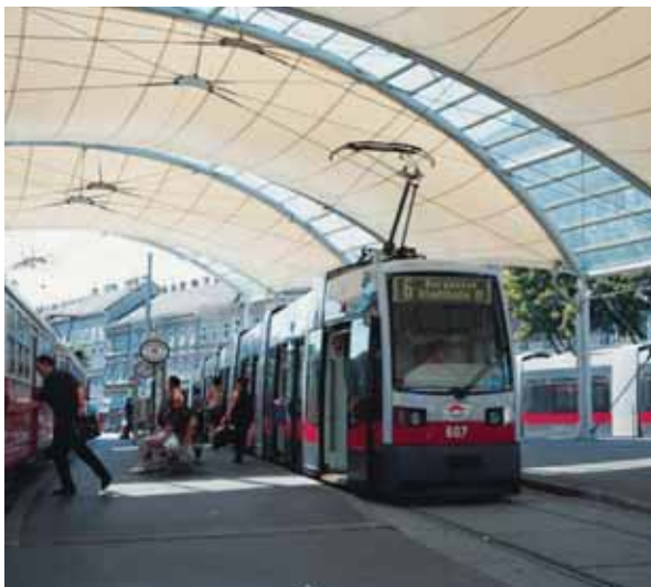
Figure 1 ULF tram from Vienna

Siemens Verkehrstechnik is one of the largest suppliers of systems for trams and other railbound vehicles in the world. Siemens received an order for 150 new low-floor trams from the city of Vienna to be supplied from the end of 2006. Vienna actively supports the development of local public transport to encourage its citizens away from their cars. In order to do this, modern, innovative and more comfortable trams are required.