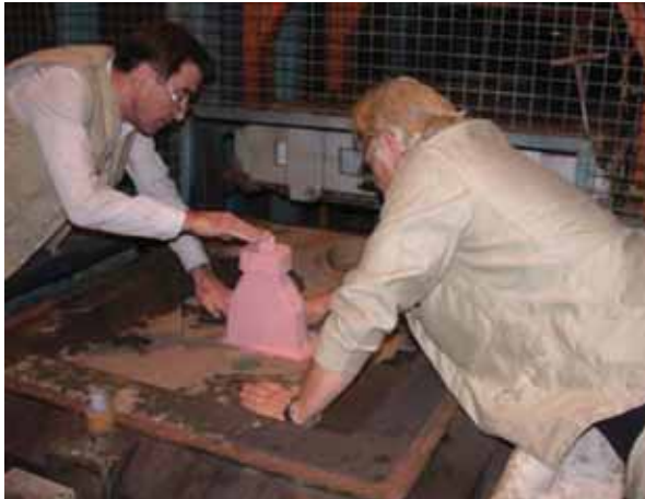
Figure 4 Moulding of inner wheel arch