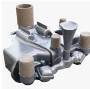
Figure 11 Outer wheel arch raw casting

With the help of KALMINEX* sleeves and STELEX* PrO filters, FOSECO ensures that FWH is able to deliver highest quality castings to Siemens SGP Verkehrstechnik (figures 11 and 12).