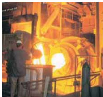
Figure 8 Filling of VARP converter

The steel charge is heated in either an induction or an arc furnace and refined in a VARP converter (Vacuum-Argon-Refinement-Process), (figure 8). With this treatment, the molten steel is desulphurised and deoxidised in a vacuum. Sulphur, nitrogen, hydrogen and oxygen are thereby reduced to minimum levels.