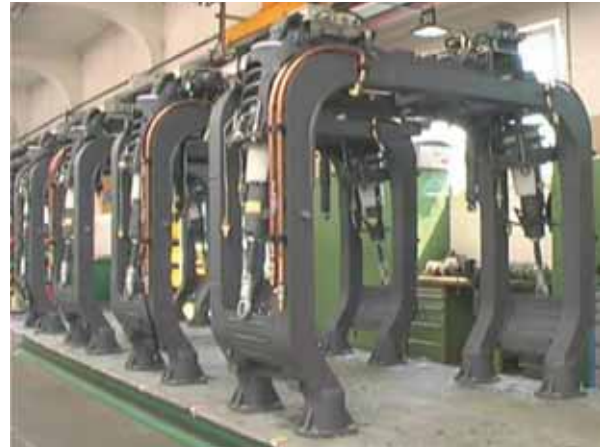
Figure 2 Row of portal frames

The chassis is constructed as a portal frame (figure 2), which spans the passenger compartment above the hinges of the vehicle modules. With this construction the low step height is achieved. The assembled wheel arch is shown in Figure 3.