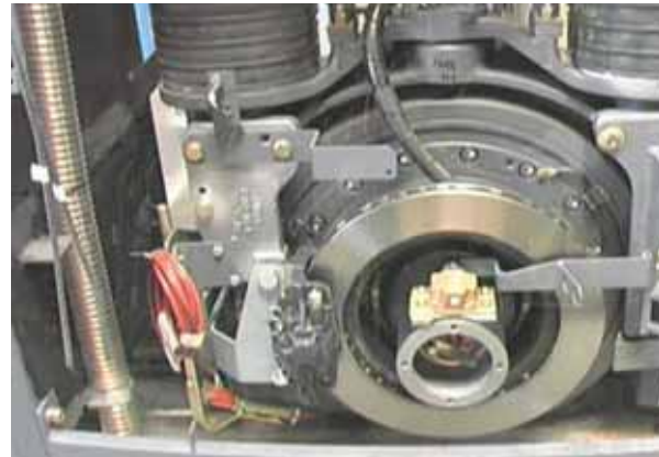
Figure 3 Assembled wheel arch