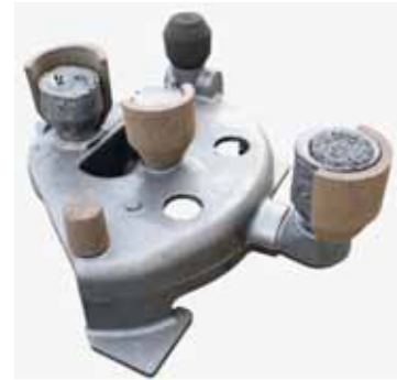
Figure 12 Inner wheel arch raw casting