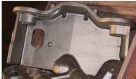
Figure 9 Interior view of outer wheel arch

At the time of writing, more than 100 trams, each of them equipped with 12 or 16 of these FWH cast wheel arches are in use in Vienna.